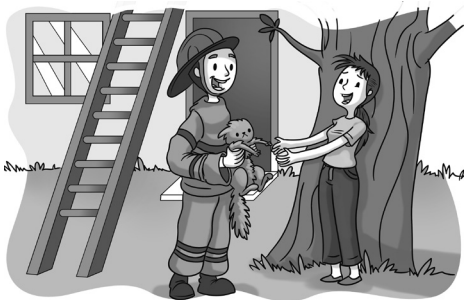
The firefighter / help Mrs Green's cat

2. The firefighter was able to help Mrs. Green's cat.