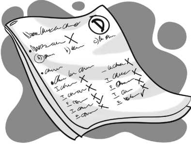
Patty / pass the test

E. Look at the pictures. Write sentences using be able to , not be able to , and be unable to in the past tense.