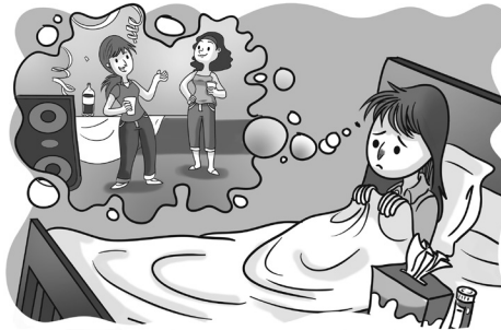
Sylvia / go to the party

3. Sylvia was unable to go to the party.