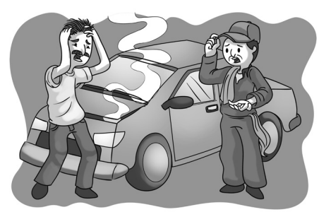
The mechanic / repair the car

6. The mechanic was unable to repair the car.